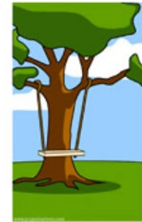
How the project leader understood it.